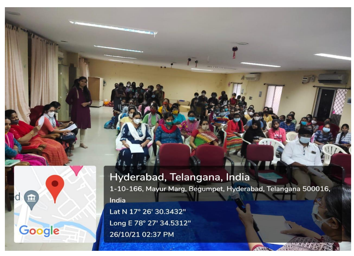
Interaction session with the students